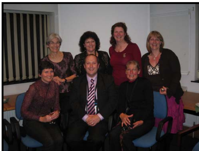
Aussies at AfPP Congress, Harrogate, UK in October

Speaker abstracts will be available on the NSW OTA official website shortly.