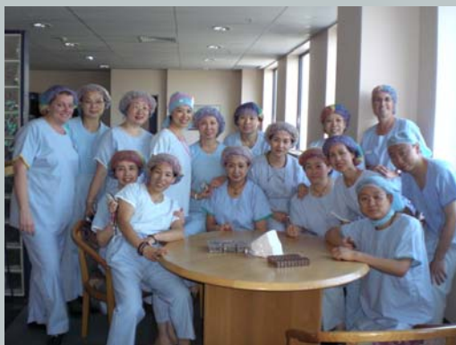
Chinese nurses enjoy some Aussie arvo tea of lamingtons and Tim Tams at Prince of Wales/Sydney Children's Hospital

During the hospital visits cameras never stopped clicking, our visitors were intrigued by our colourful scrub caps, lack of overshoes, lockers adorned with photos and the lamingtons served up for arvo tea!