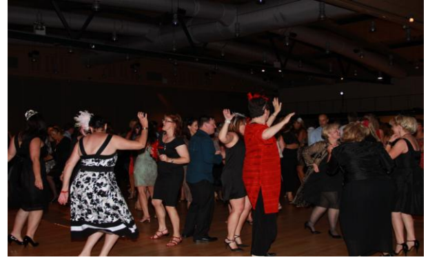
Partying the night away!