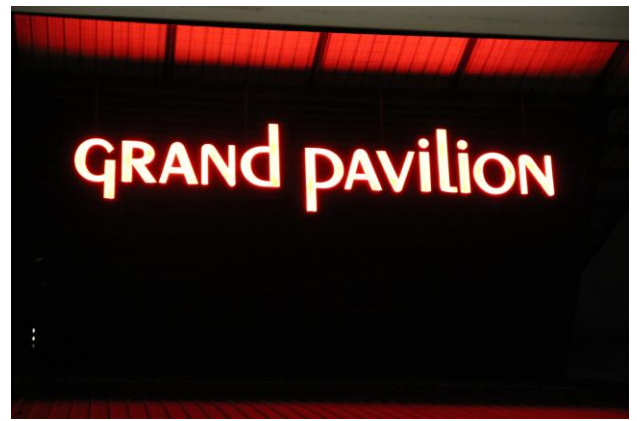
The venue for the 'Fascinating Friday' Conference Dinner.