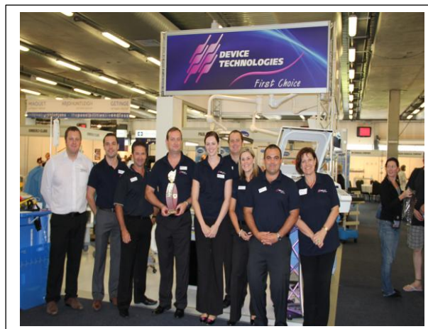
The Device Technologies team with the trophy

A huge THANK YOU to 48 trade partners for their efforts and their enthusiasm. Without your support the conference would not have been the success that it was. Your continuing support of the NSW OTA is greatly appreciated and we hope to continue our relationship with each and every one of you